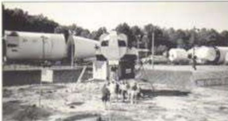
Space and Rocket Museum in Huntsville, Alabama: in the background a real, complete Saturn V rocket disassembled in its stages. In the foreground, a mockup of the Apollo moon lander on an area of re-created moon landscape.